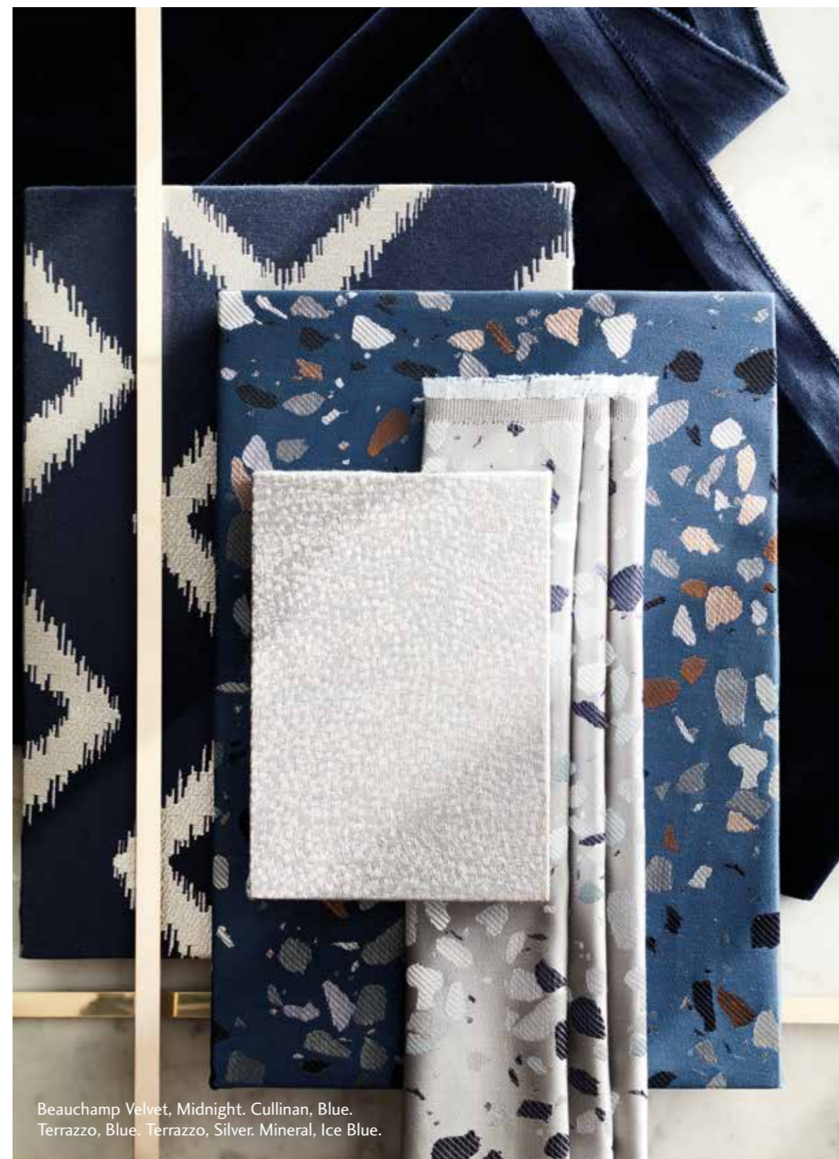
Beauchamp Velvet, Midnight. Cullinan, Blue. Terrazzo, Blue. Terrazzo, Silver. Mineral, Ice Blue.