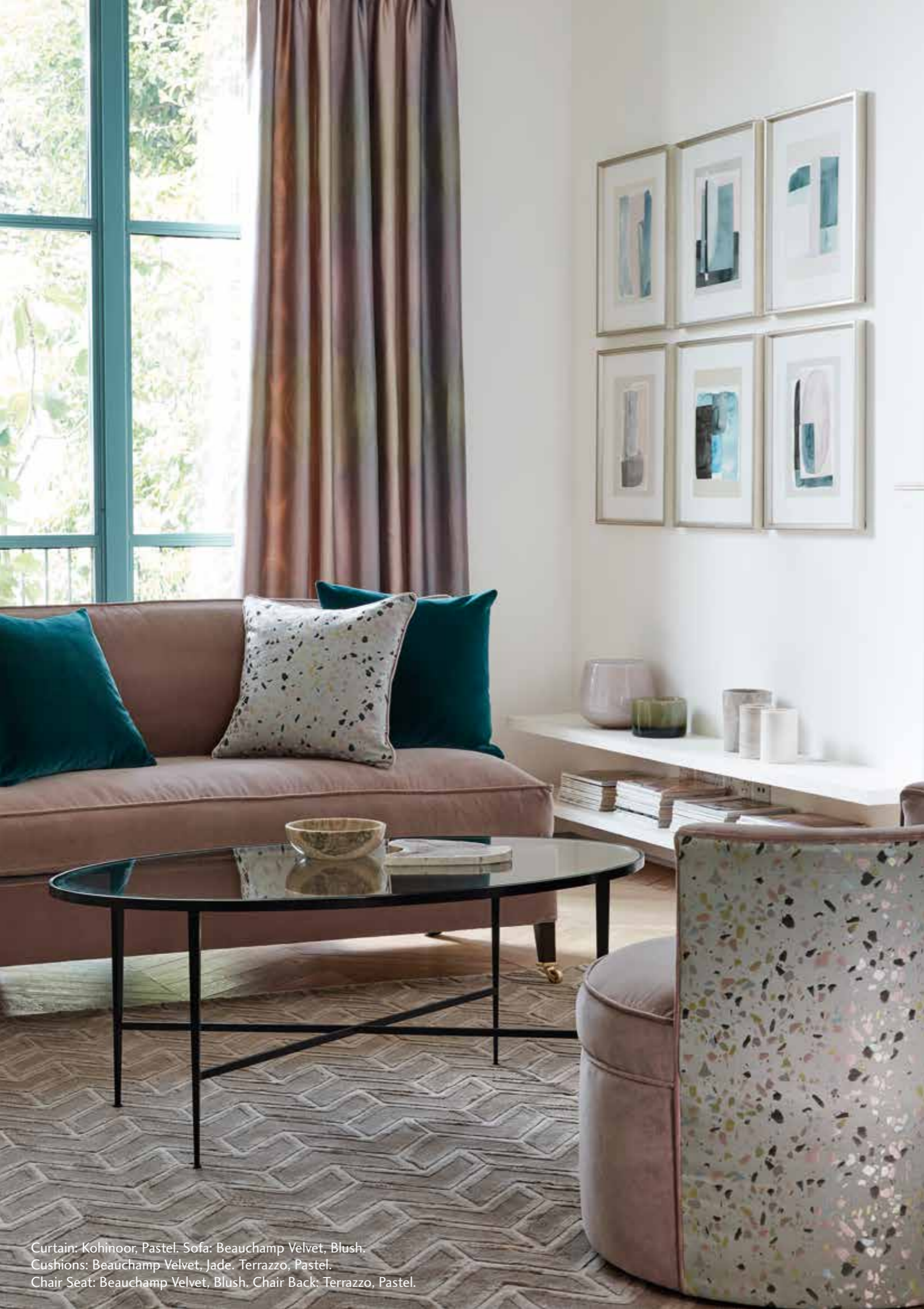
Curtain: Kohinoor, Pastel. Sofa: Beauchamp Velvet, Blush. Cushions: Beauchamp Velvet, Jade. Terrazzo, Pastel. Chair Seat: Beauchamp Velvet, Blush. Chair Back: Terrazzo, Pastel.