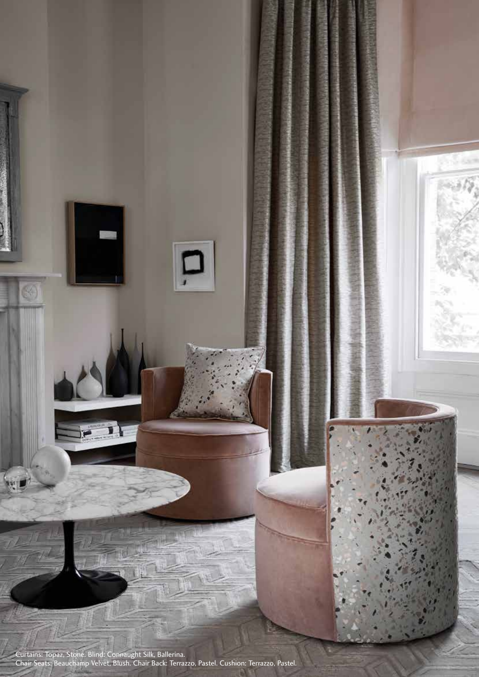
Curtains: Topaz, Stone. Blind: Connaught Silk, Ballerina. Chair Seats: Beauchamp Velvet, Blush. Chair Back: Terrazzo, Pastel. Cushion: Terrazzo, Pastel.