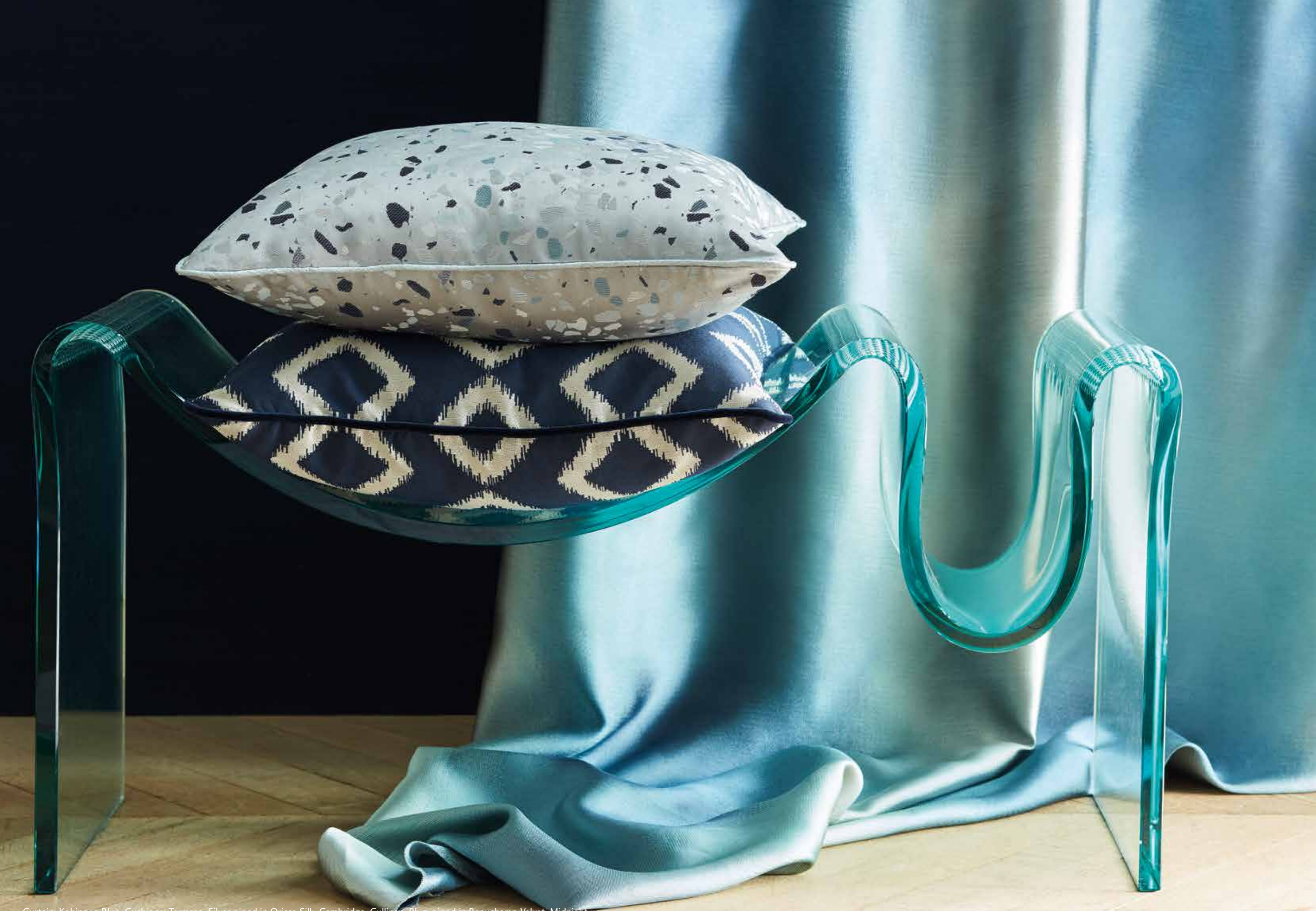
Curtain: Kohinoor, Blue. Cushions: Terrazzo, Silver piped in Orissa Silk, Cambridge. Cullinan, Blue, piped in Beauchamp Velvet, Midnight.