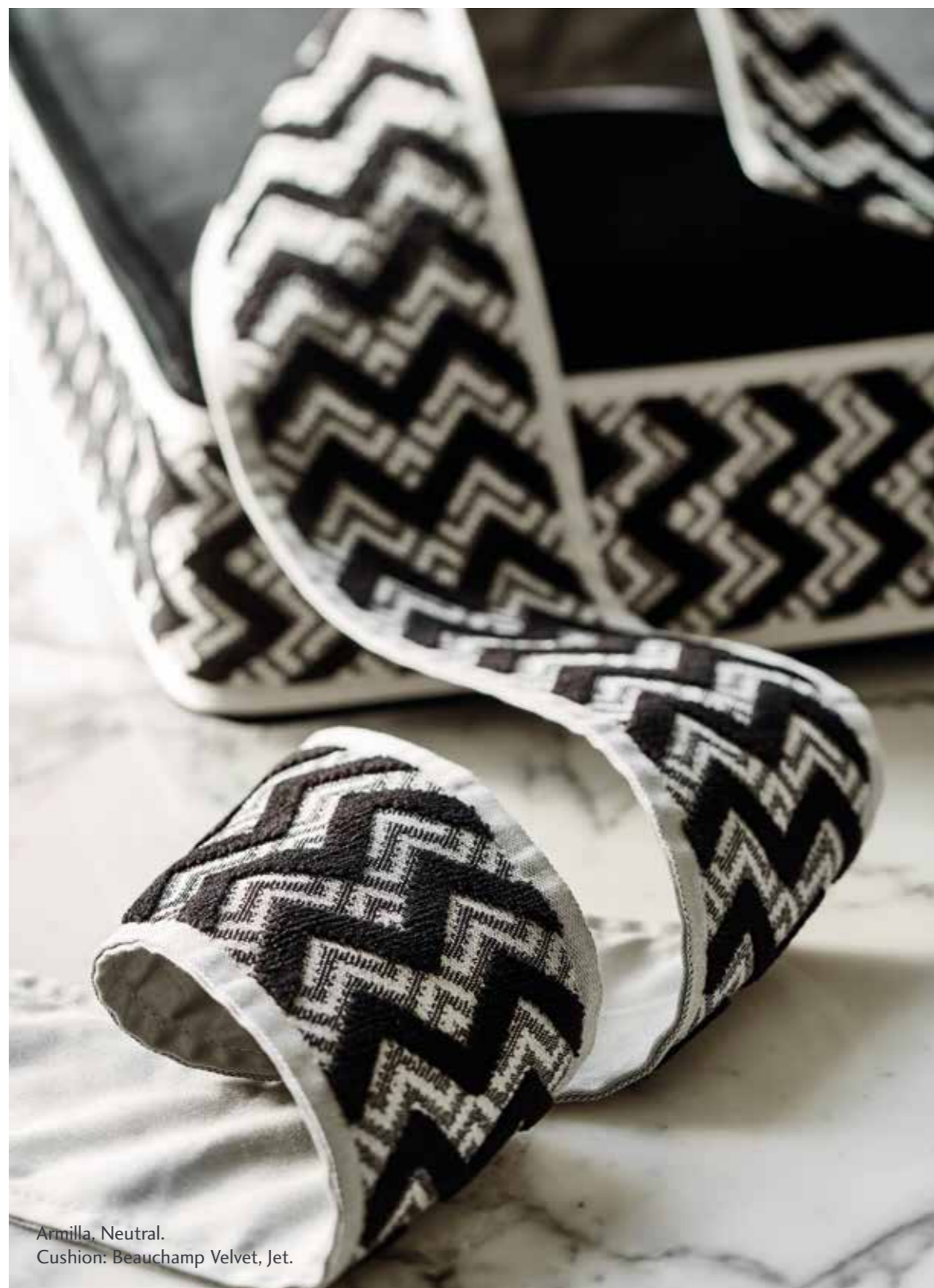
Armilla, Neutral. Cushion: Beauchamp Velvet, Jet.