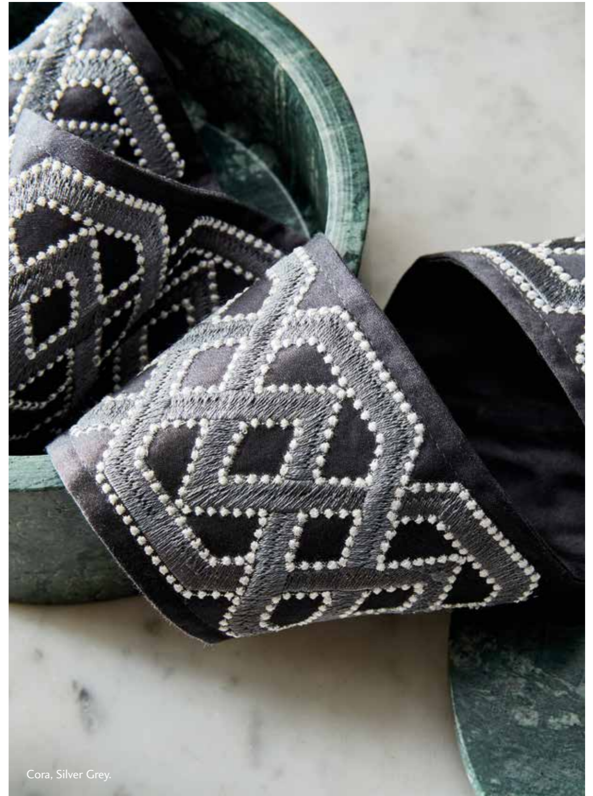
Cora, Silver Grey.