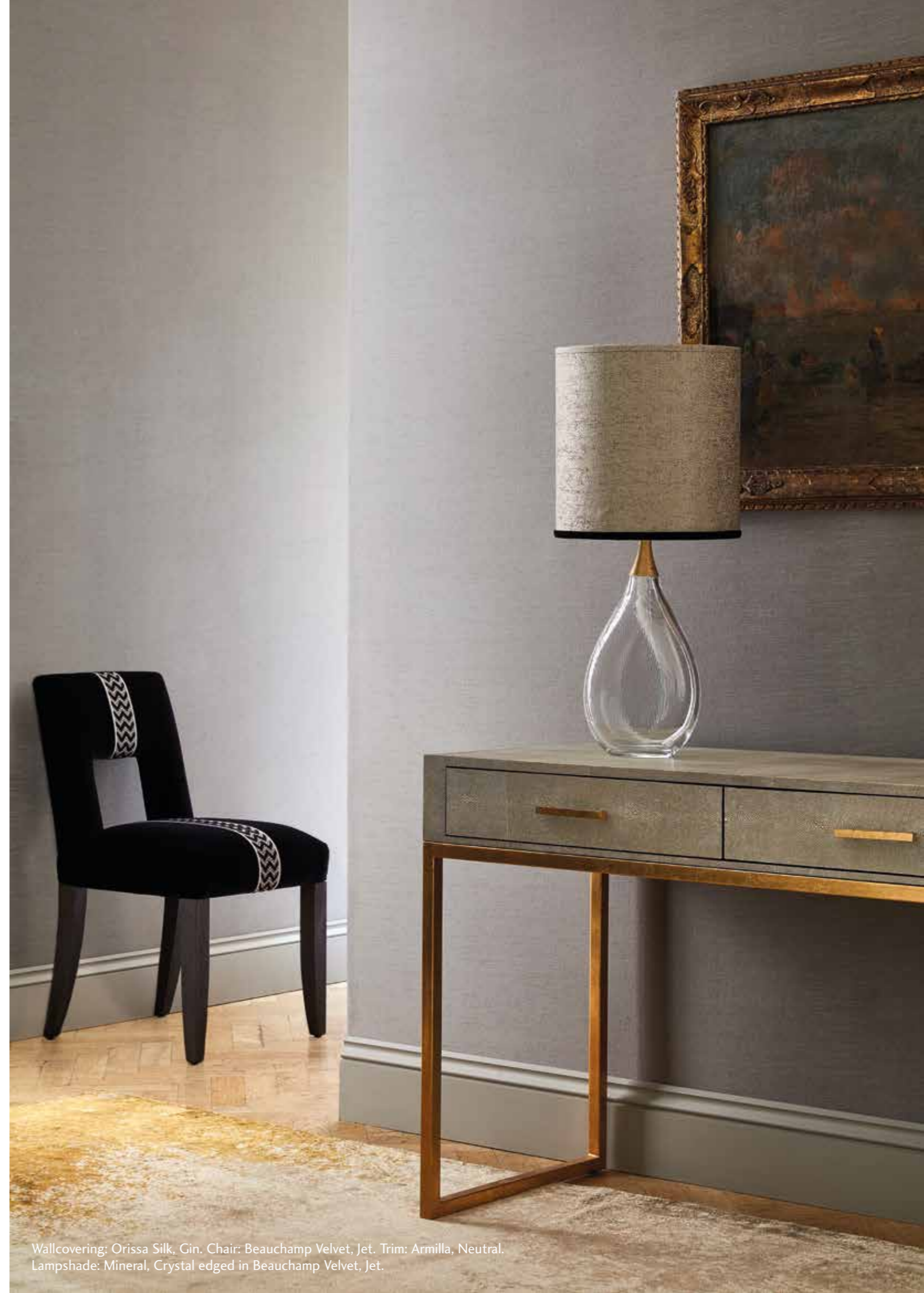
Wallcovering: Orissa Silk, Gin. Chair: Beauchamp Velvet, Jet. Trim: Armilla, Neutral. Lampshade: Mineral, Crystal edged in Beauchamp Velvet, Jet.