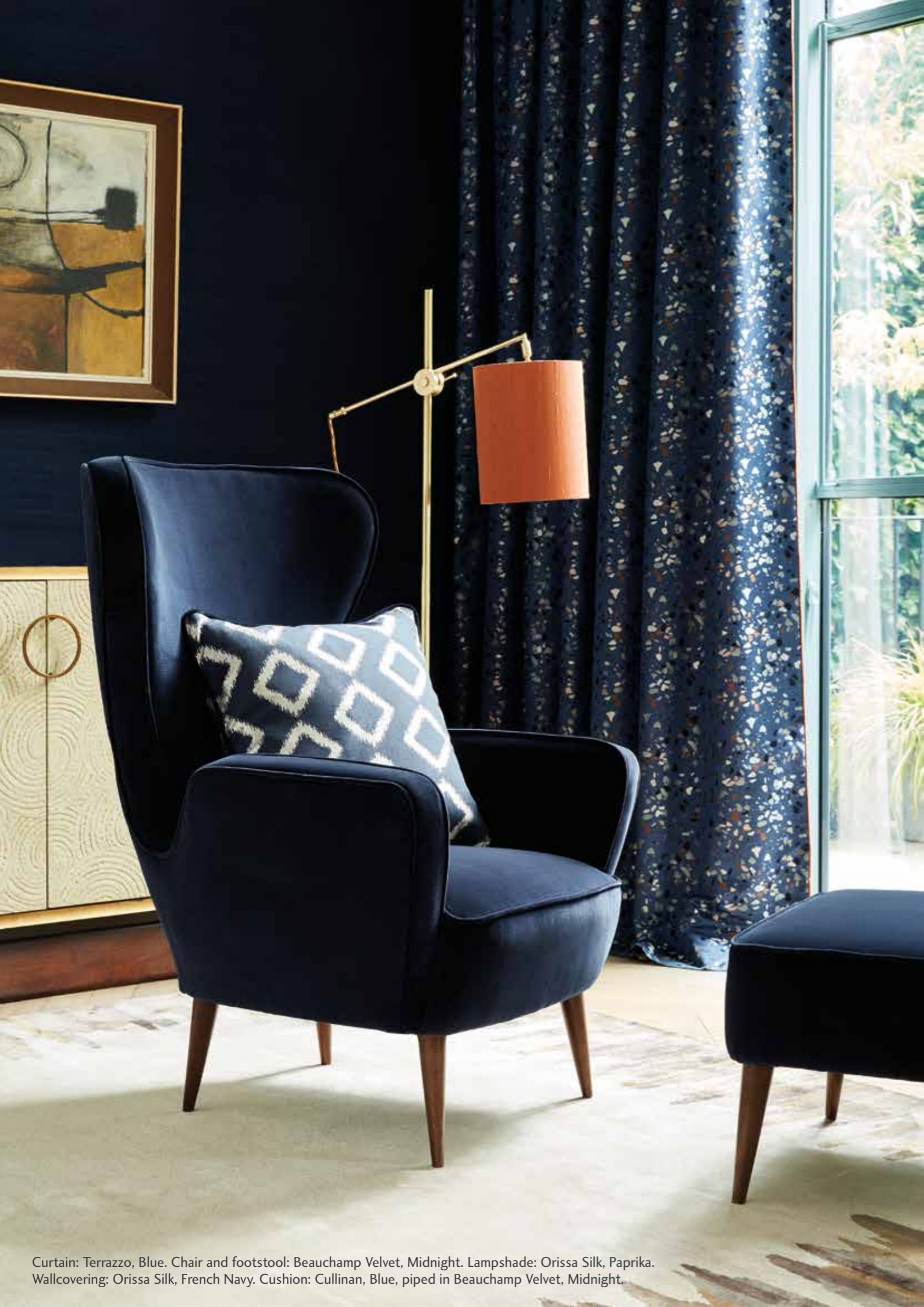
Curtain: Terrazzo, Blue. Chair and footstool: Beauchamp Velvet, Midnight. Lampshade: Orissa Silk, Paprika. Wallcovering: Orissa Silk, French Navy. Cushion: Cullinan, Blue, piped in Beauchamp Velvet, Midnight.