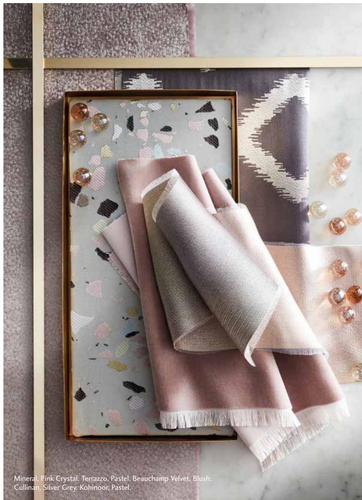
Mineral, Pink Crystal. Terrazzo, Pastel. Beauchamp Velvet, Blush. Cullinan, Silver Grey. Kohinoor, Pastel.