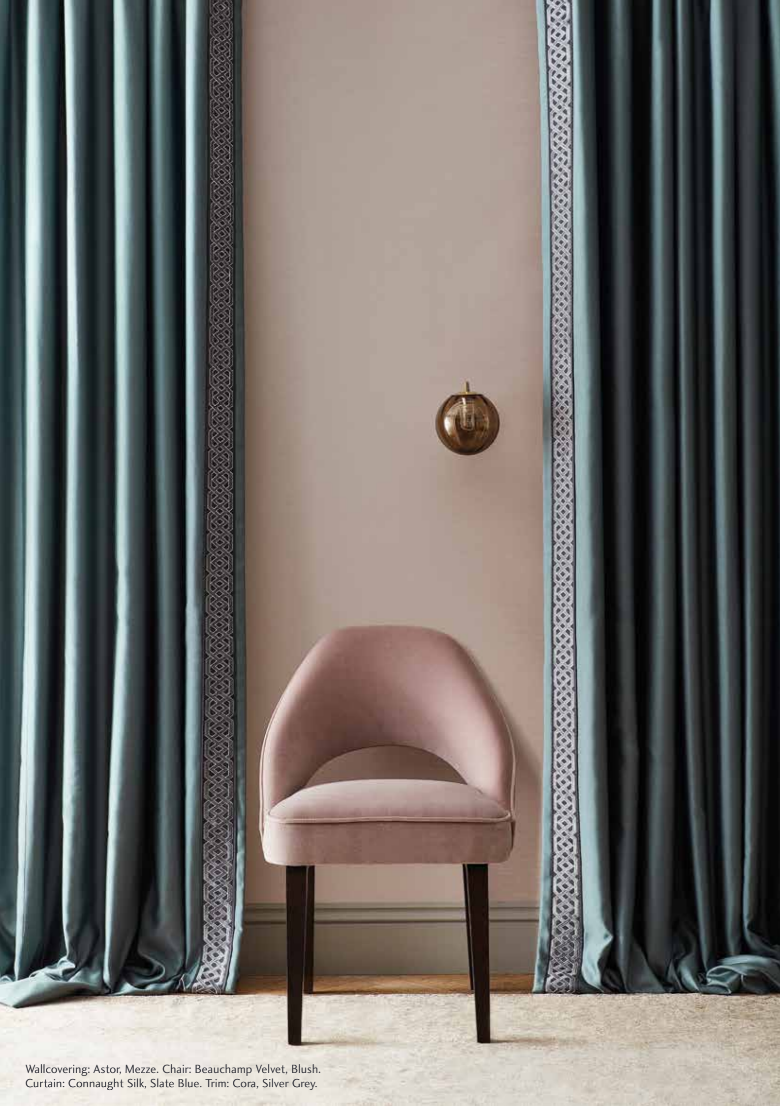
Wallcovering: Astor, Mezza. Chair: Beauchamp Velvet, Blush. Curtain: Connaught Silk, Slate Blue. Trim: Cora, Silver Grey.