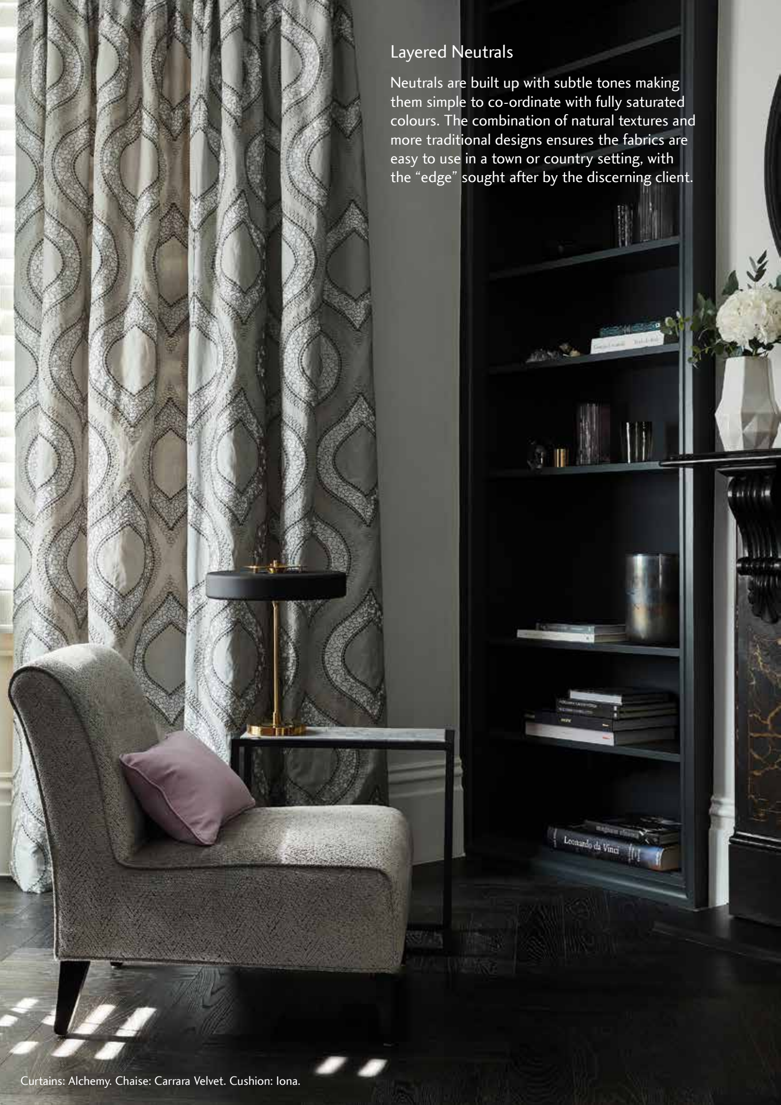
Curtains: Alchemy. Chaise: Carrara Velvet. Cushion: Iona.

Neutrals are built up with subtle tones making them simple to co-ordinate with fully saturated colours. The combination of natural textures and more traditional designs ensures the fabrics are easy to use in a town or country setting, with the “edge” sought after by the discerning client.