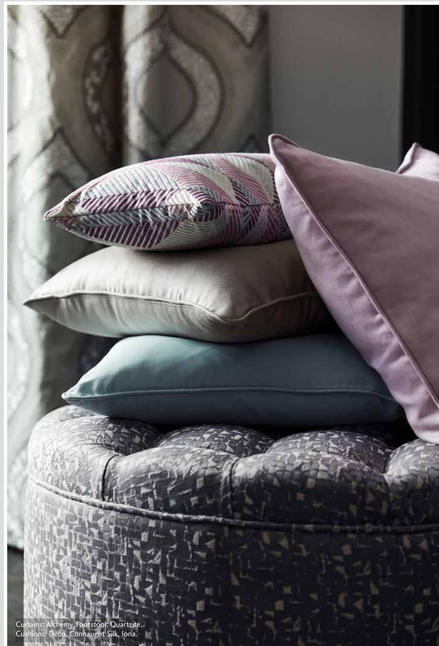
Curtains: Alchemy. Footstool: Quartzite. Cushions: Deco, Connaught Silk, Iona.