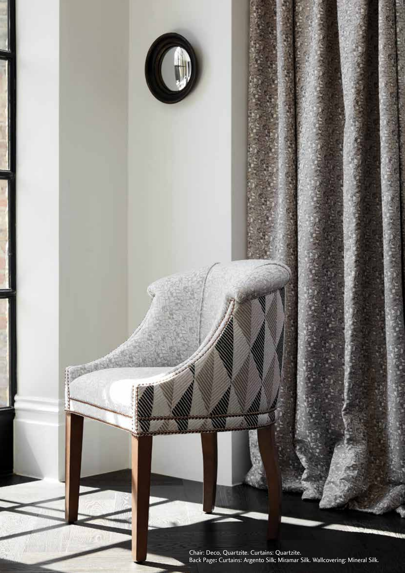
Chair: Deco, Quartzite. Curtains: Quartzite. Back Page: Curtains: Argento Silk; Miramar Silk. Wallcovering: Mineral Silk.