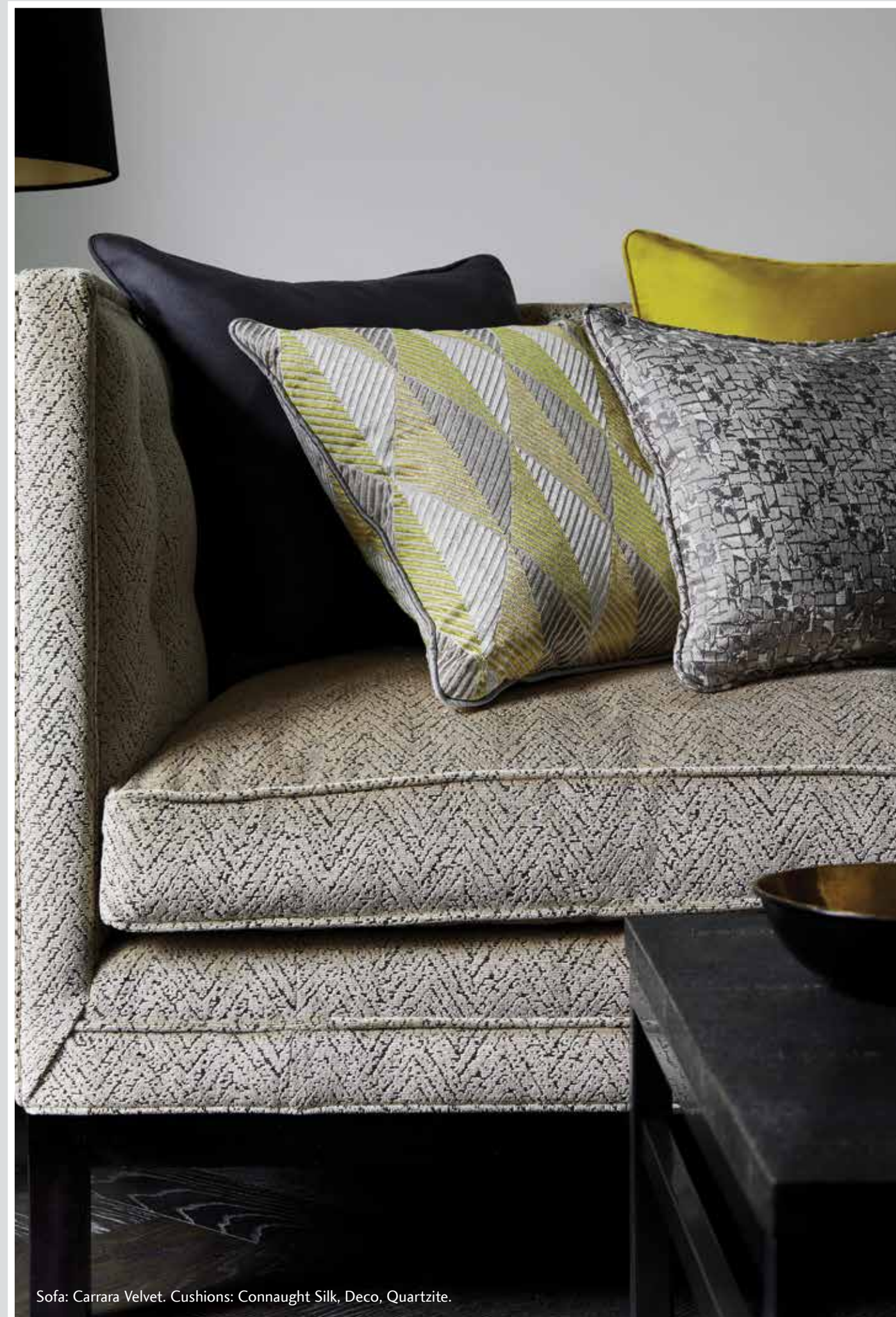
Sofa: Carrara Velvet. Cushions: Connaught Silk, Deco, Quartzite.