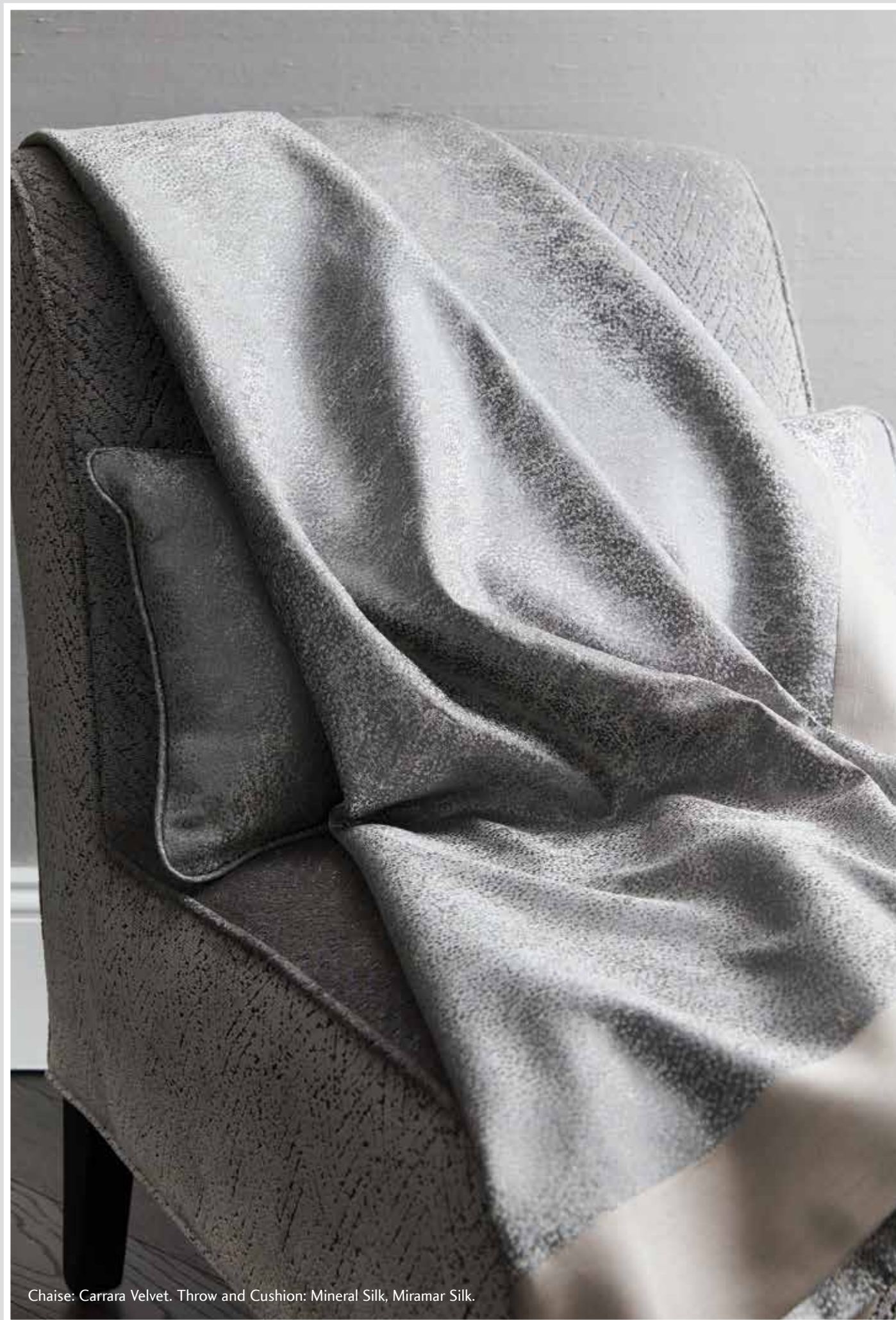
Chaise: Carrara Velvet. Throw and Cushion: Mineral Silk, Miramar Silk.