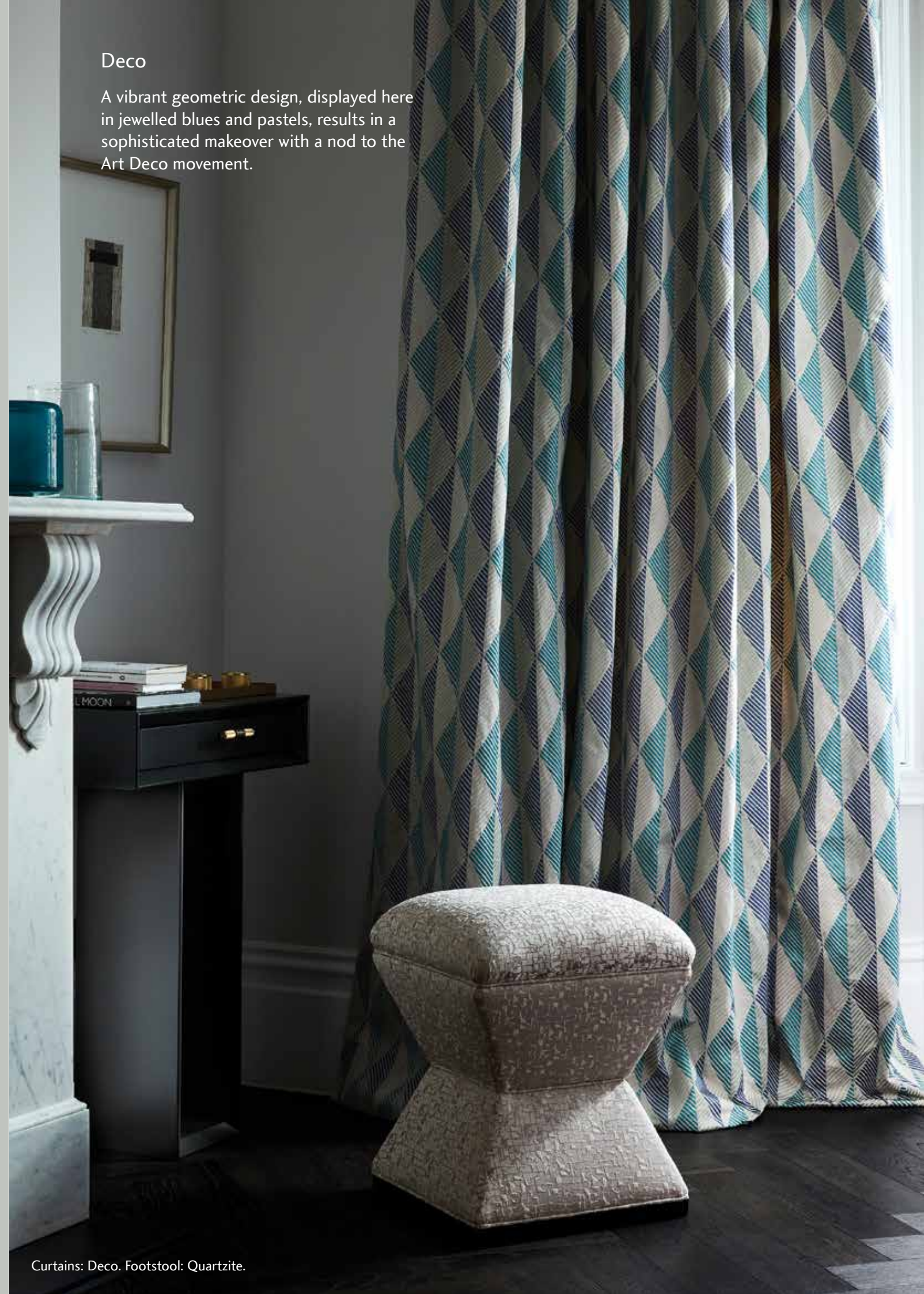
Curtains: Deco. Footstool: Quartzite.

A vibrant geometric design, displayed here in jewelled blues and pastels, results in a sophisticated makeover with a nod to the Art Deco movement.